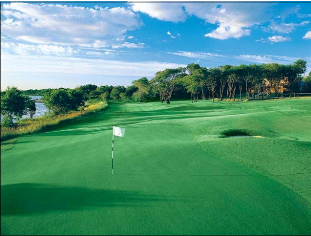
Carnegie Abbey Portsmouth, RI