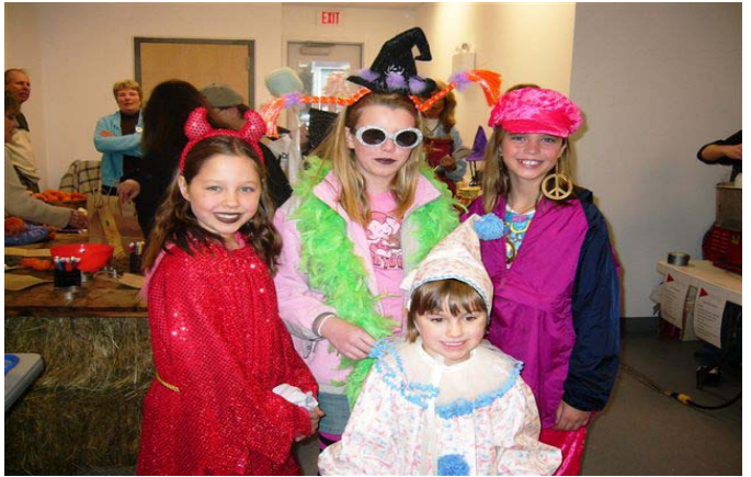
Colorful costumes ruled

Frerichs Farm, Accents by Jen, Avon, Home Interiors, Kangaroo Kids, Mary Kay, Newport Yachting Center, Pampered Chef, The Sensational Child, Southern Living at Home, Stampin’ Up, Traveling Scrapper and Wild Tree Herbs