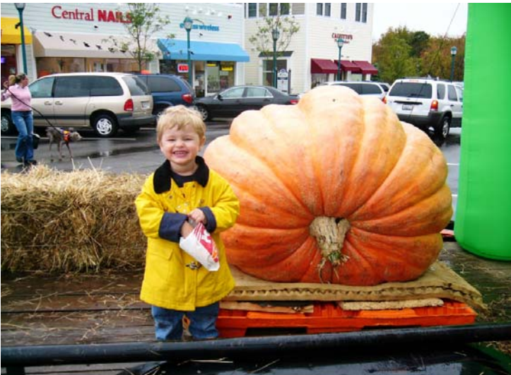
The “Great Pumpkin” brought lots of smiles