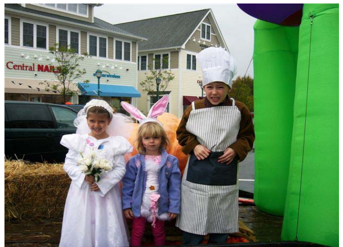
The bride, the bunny and the baker?